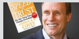
Stephen M.R. Covey Co-Founder & CEO CoveyLink Worldwide