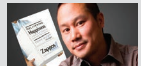
Tony Hsieh CEO Zappos